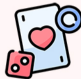
GAMING TABLES AREA